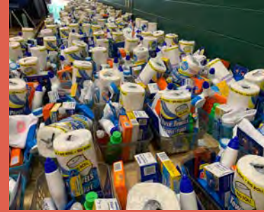
Home Sweet Home Joy Kits