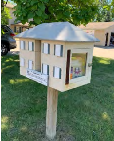
A Free Little Library station in Brown County

The drive provided books to children through the Free Little Library system in the Navarino, Downtown, Whitney Park and Joannes Park neighborhoods across Green Bay. Those neighborhoods have many households identifying as ALICE (Asset Limited, Income Constrained, and Employed), mainly living paycheck-to-paycheck.