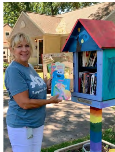
Aon employee filling a Free Little Library

Aon employees stocked six Free Little Libraries with over 75 new and gently used children's books over the summer. They aim to get more kids interested in books and parents involved in reading with their children. Through Aon's corporate volunteer engagement project, they hope to encourage kids to develop a love for reading, learning and success.