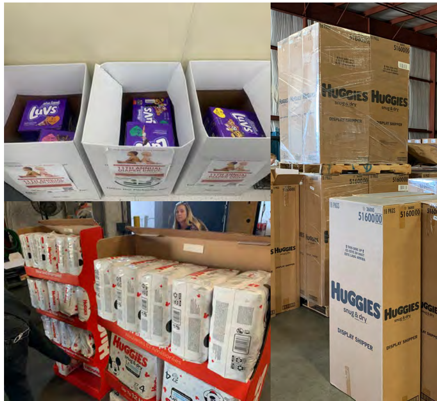
Donated diapers from Kimberly-Clark and Festival Foods

The recipient partners, Family & Resource Center of N.E.W. and Love Life Ministry, gathered with volunteers to sort through the thousands of donated diapers. Everything will be distributed to families in need.