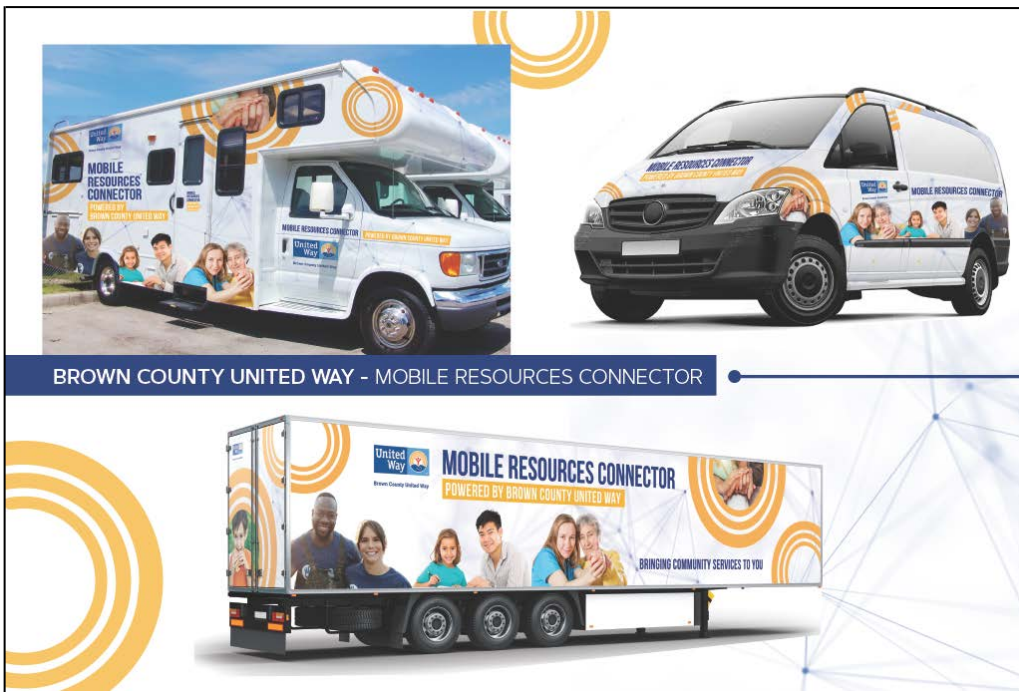
Artist's rendering of the three Mobile Resource Connector vehicles that will be bringing services to people in need in Brown County.

"The initiative will increase equity and eliminate disparities by creating a robust, accessible, coordinated service delivery model that brings multiple sources together in one place, tailored to the needs of the people who can't come to